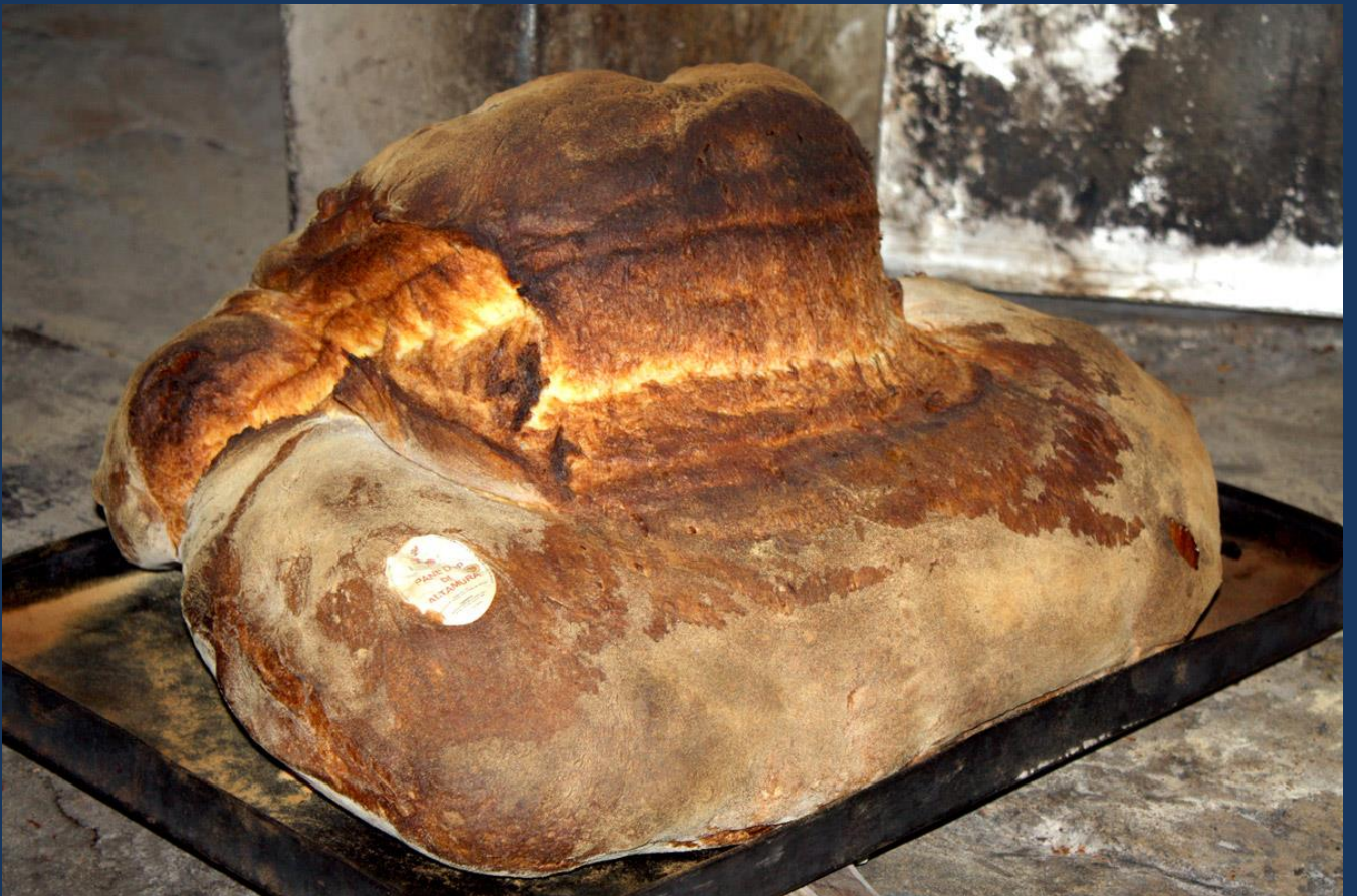
Altamura , the bread town – where the traditional local bread is kosher!!