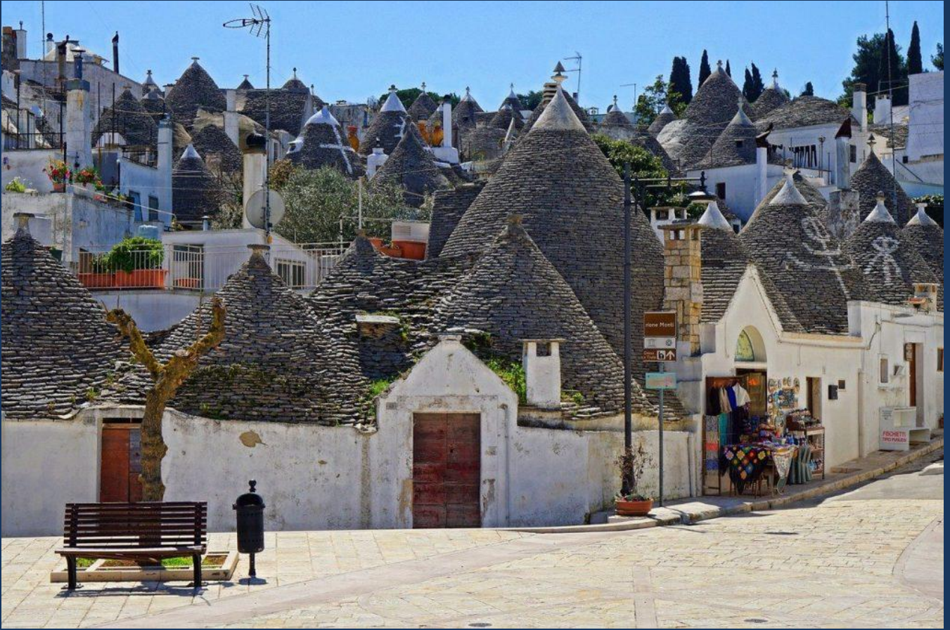
Alberobello , famous for its hundreds of trulli houses